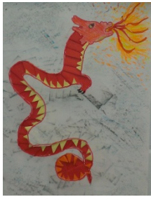
Figure 4: Rhucha's paper relief