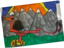
Figure 3: Lego Dragon