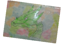
Figure 5: Highly Commended